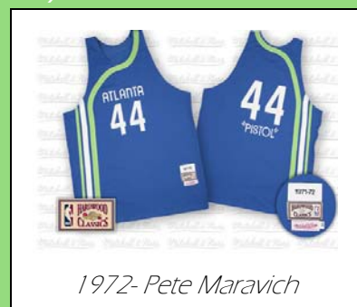
1972- Pete Maravich