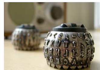
Pictured Top: IBM Selectric Typewriter, Pictured Bottom: Typewriter elements