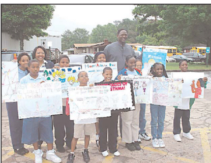
Dominique Wilkins with students at Tilson Elementary

"Asthma research is a lot better and new medicines... will help young people" Wilkins, 2003