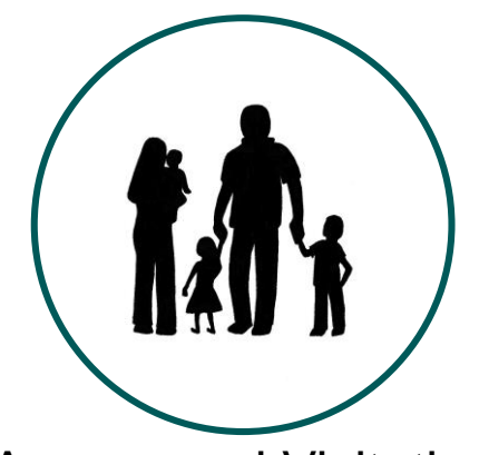
Access and Visitation referrals